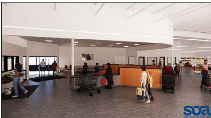
View inside the new retail space, from cooler/freezer storage toward checkout and the waiting room.

In addition to healthcare, The Food Bank Market will offer a number of other resources that bring much-needed services and support to our neighbors. A larger, more accessible retail space will provide a grocery store-like atmosphere that is welcoming and accessible; a demonstration kitchen will create the opportunity to learn about preparing healthier items, like fresh produce; and spaces for visiting services will offer education on topics like Medicare, health insurance, utilities assistance and more.