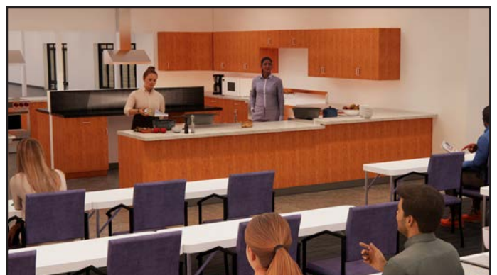
View from the community room into the teaching kitchen, which also opens to the retail floor.