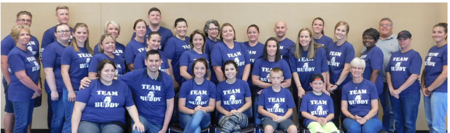
Commerce Bank employees were recognized as the "Volunteers of the Month" in August. The bank regularly contributes both in the Volunteer Room and through generous financial support.

"Giving to The Food Bank, you know where your dollars are going," he says. "They're going where you expect them to go."