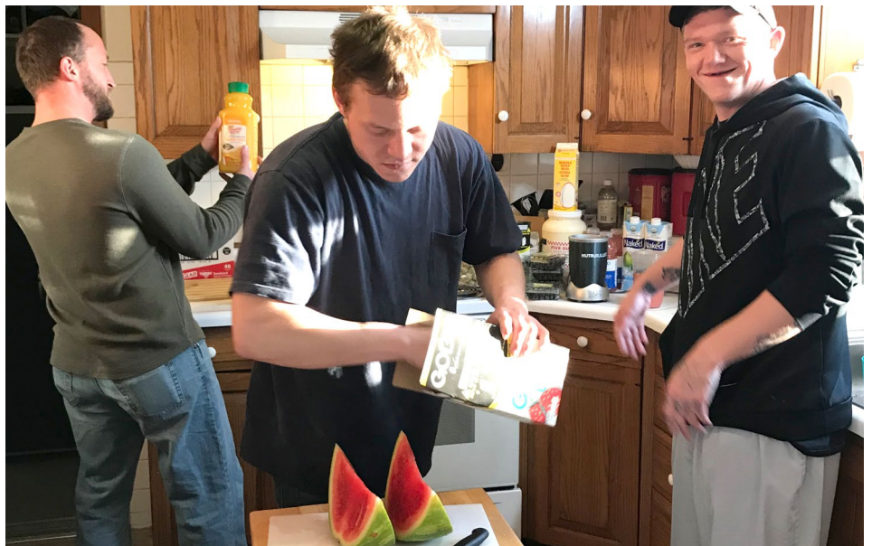
Residents at In2Action enjoy watermelon and juice.

Because the program requires clients to wait 30 days before