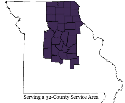
Serving a 32-County Service Area